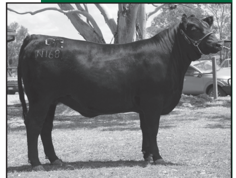
Raff Duchess N168 - she sells as lot 43

Part of the excitement in moving south was knowing that our cattle will be raised in an environment where they are able to reach their true genetic potential naturally. Previously we often found ourselves having to place our sale cattle in an intense feed environment from a young age to allow genetic expression and to meet sale preparation deadlines. Since moving here, we have broken all records. Our 2017 autumn born bull calves averaged 420kg's at 9 months with three over 500 kilograms whilst our 2018 autumn born bulls averaged 438kgs at a similar age. They were all 100% grass fed – no hay or silage and no pellet supplements.