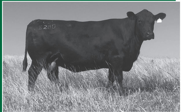
Raff Blackbird E280 - her son sells as lot 22 at the Sydney Show Angus Feature Breed Sale Sunday 14th April.

The collection of embryos for genetic advantages has been a pivotal part of our breeding success since pioneering days in the 1980's. We have a number of embryos in the tank and plan to flush late Autumn and throughout the year if requested. The heart of our herd can be accessed and offers a unique opportunity to fast track any breeding program. We would consider flushing selected cows of interest to sires of your choice if required.