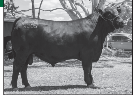
Raff Necessity N205 - he sells as lot 22

Our show team comprises of four elite stud sires, one of which has been used, two magnificent joined heifers and one powerful cow/calf unit. We are very proud to offer such an exciting group of Raff Angus and strongly encourage enquiry and inspection of this show team. They are genetically different with performance beyond a graph and have 53 years of dedicated breeding behind them with our increased emphasis on weight for age, feed efficiency, carcase weight and retail beef yield.